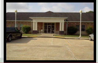
Business & Career Solutions Center